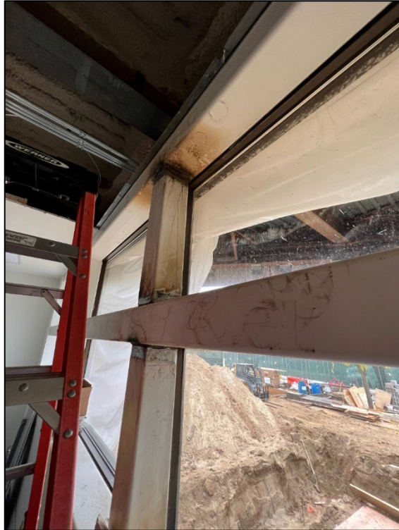
Installation of new support column inside Youth staff workroom.