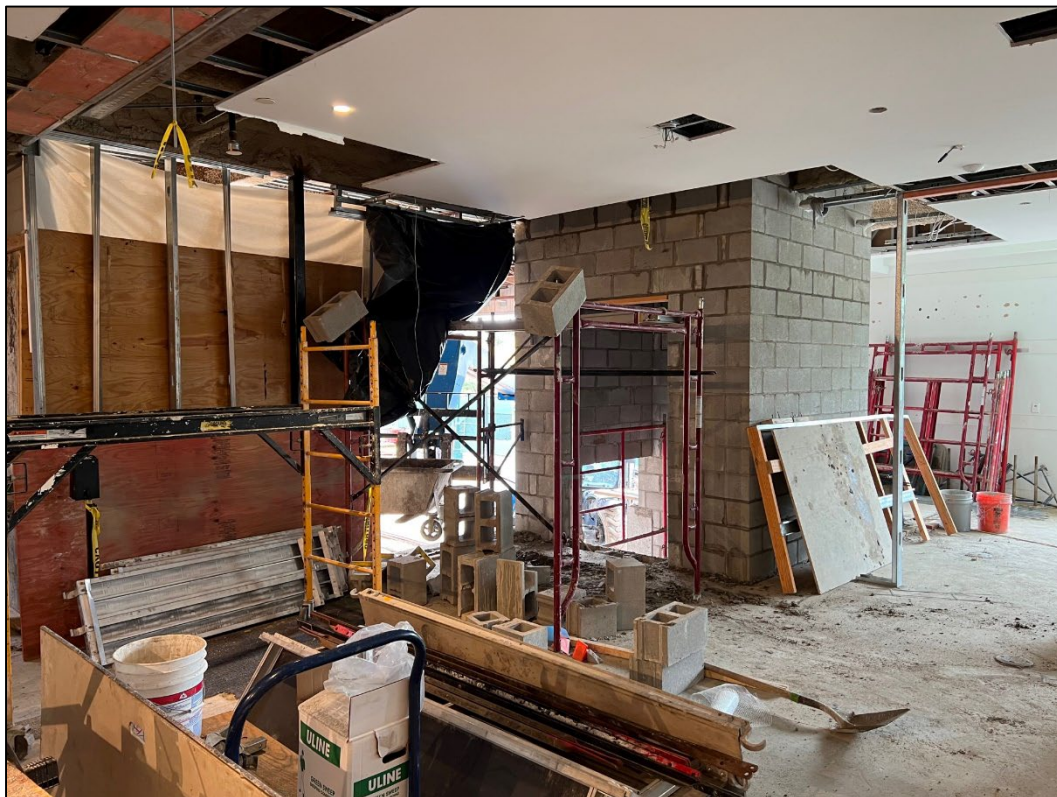
View of new elevator shaft from future Information Desk