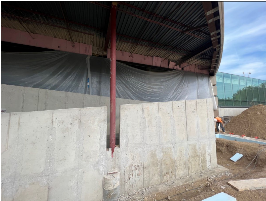
View of south wall of new interior ramp.