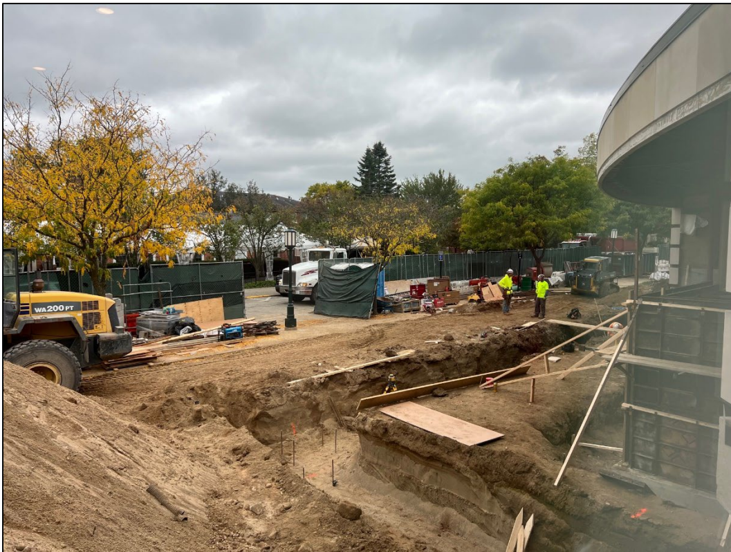
View of excavation in progress for new footings.