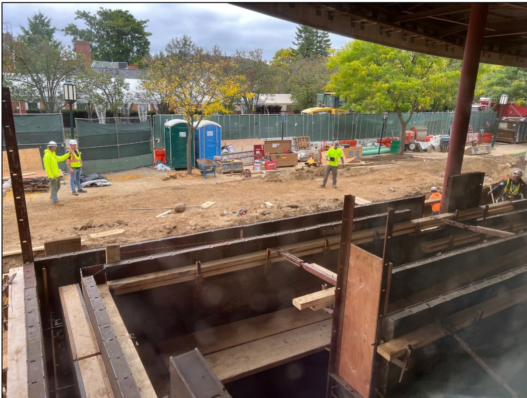
Ramp progress shown from inside Youth staff workroom