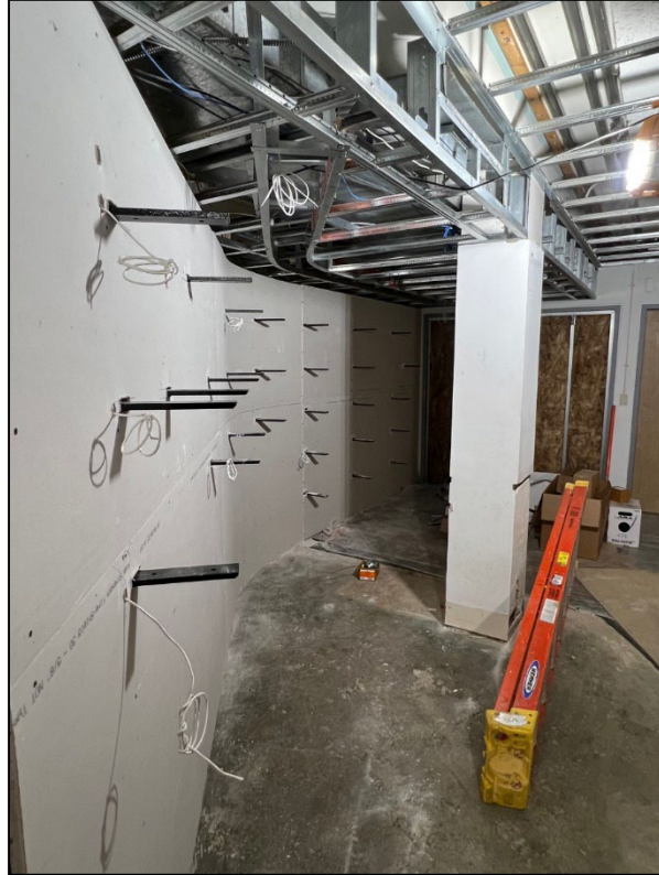
View of future Friends' Bookshop