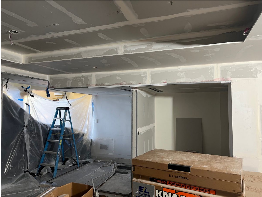
View of new study rooms on the east side of the center gallery.