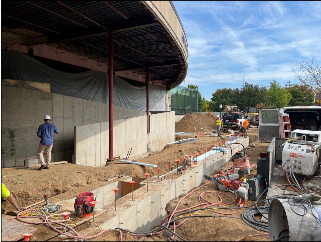
View of addition from southwest corner of entrance.