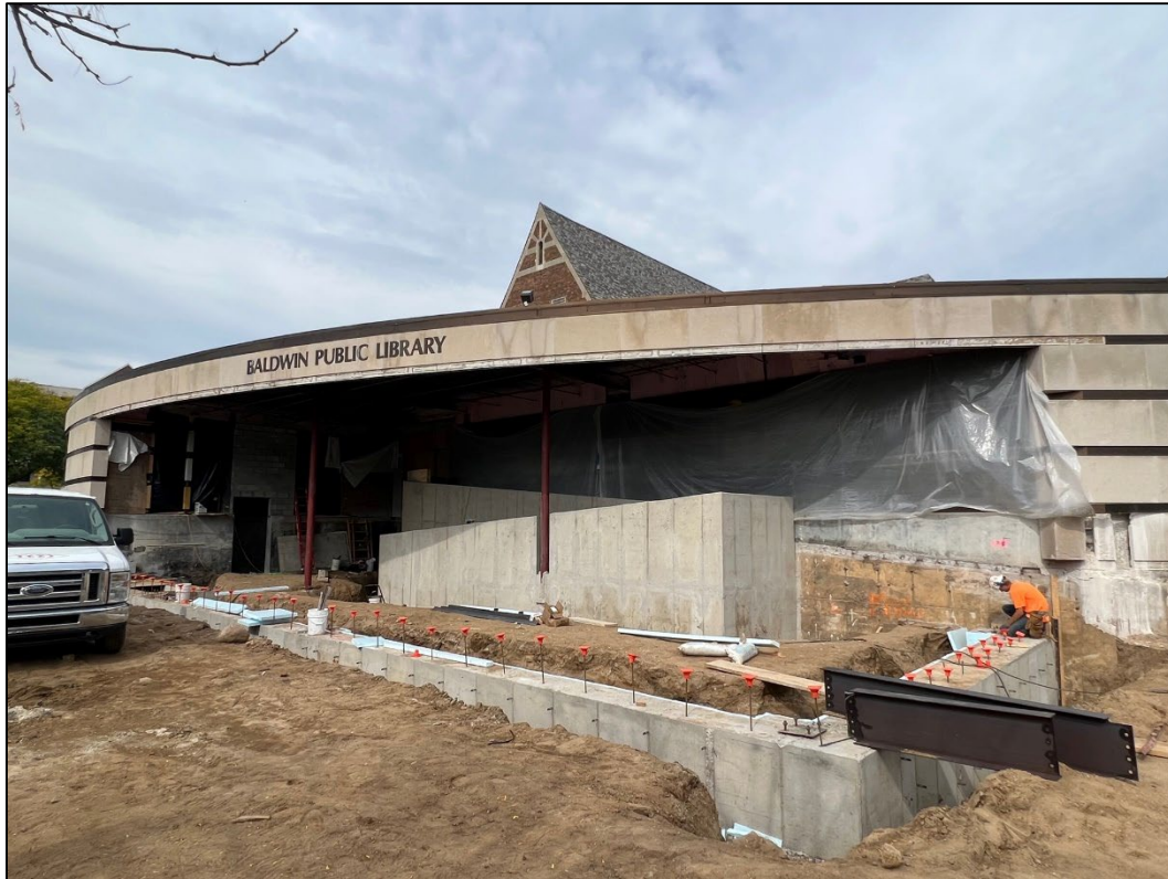
October 4, 2023: View of footings for exterior addition and concrete ramp walls.