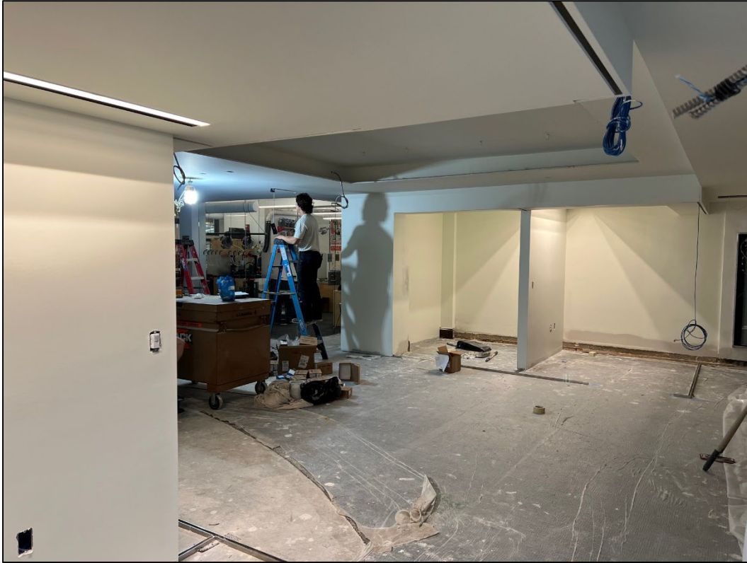
West side study rooms in progress above. Idea Lab hold shelving in progress.