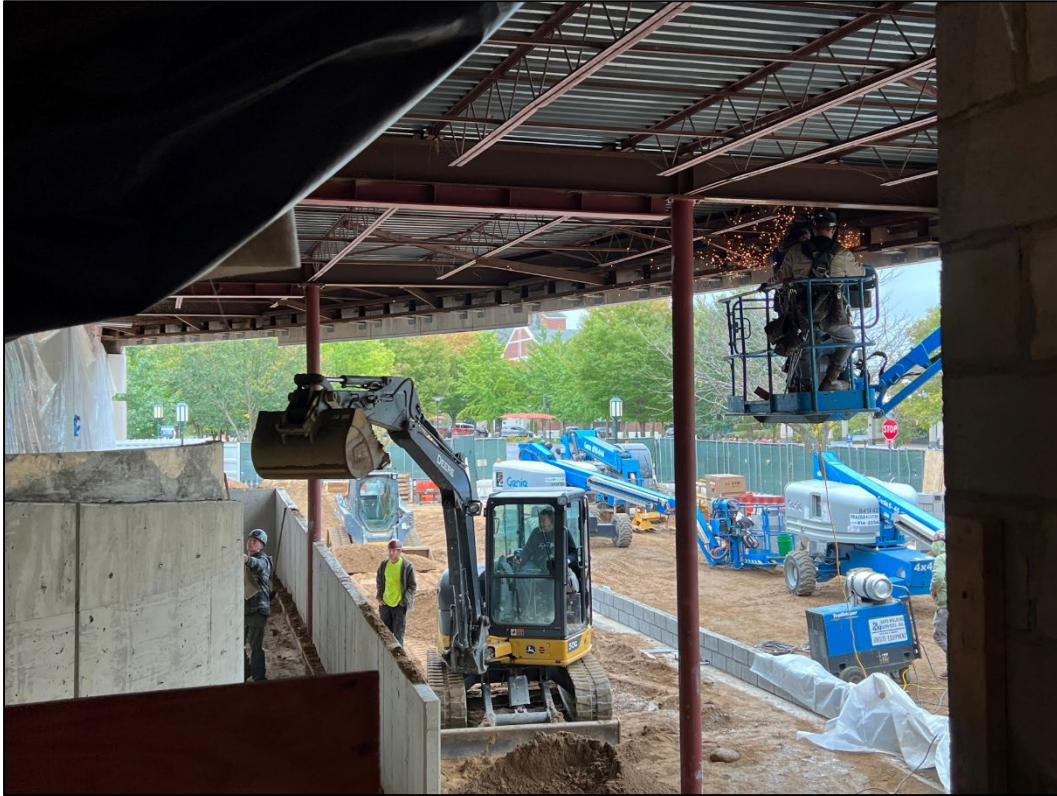
October 11, 2023: Ironwork on new roof expansion and fill dirt being added to ramp.