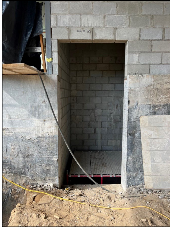
View of new elevator door opening.