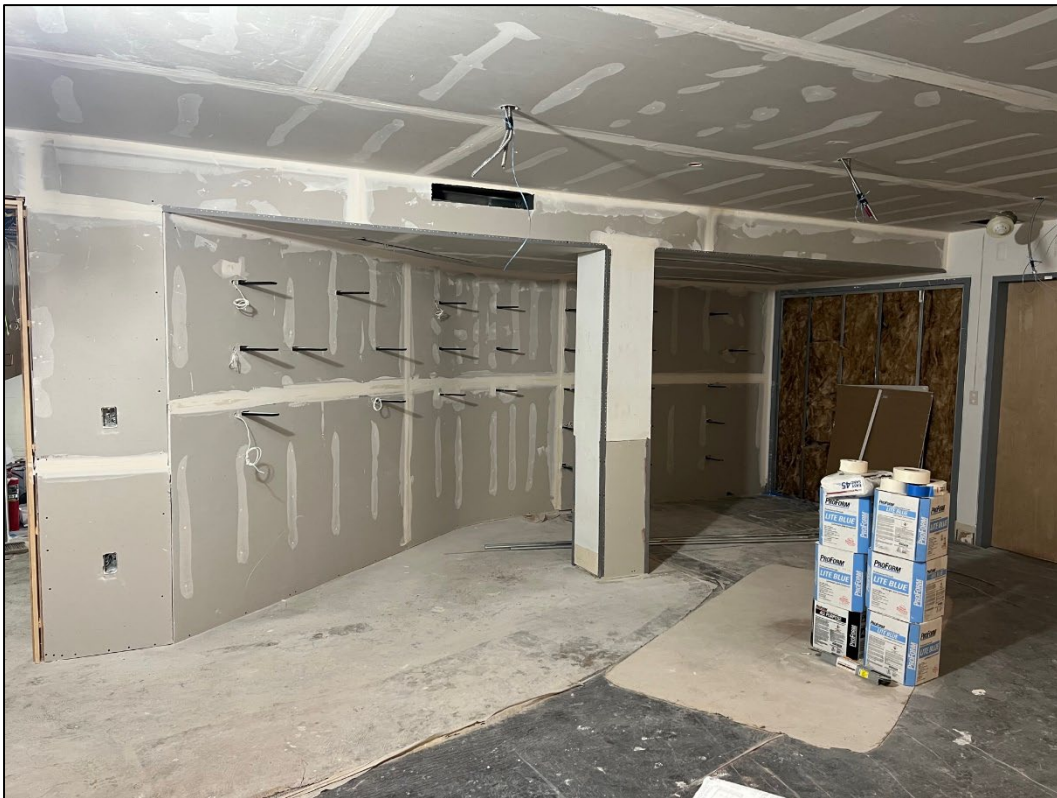
View of new Friends' Bookshop.