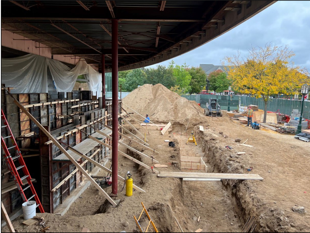
September 27, 2023: Ramp formation in progress. Ground preparation for addition footings.