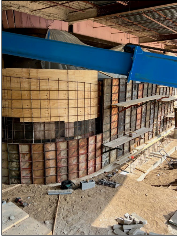
Concrete forms for new ramp in progress.