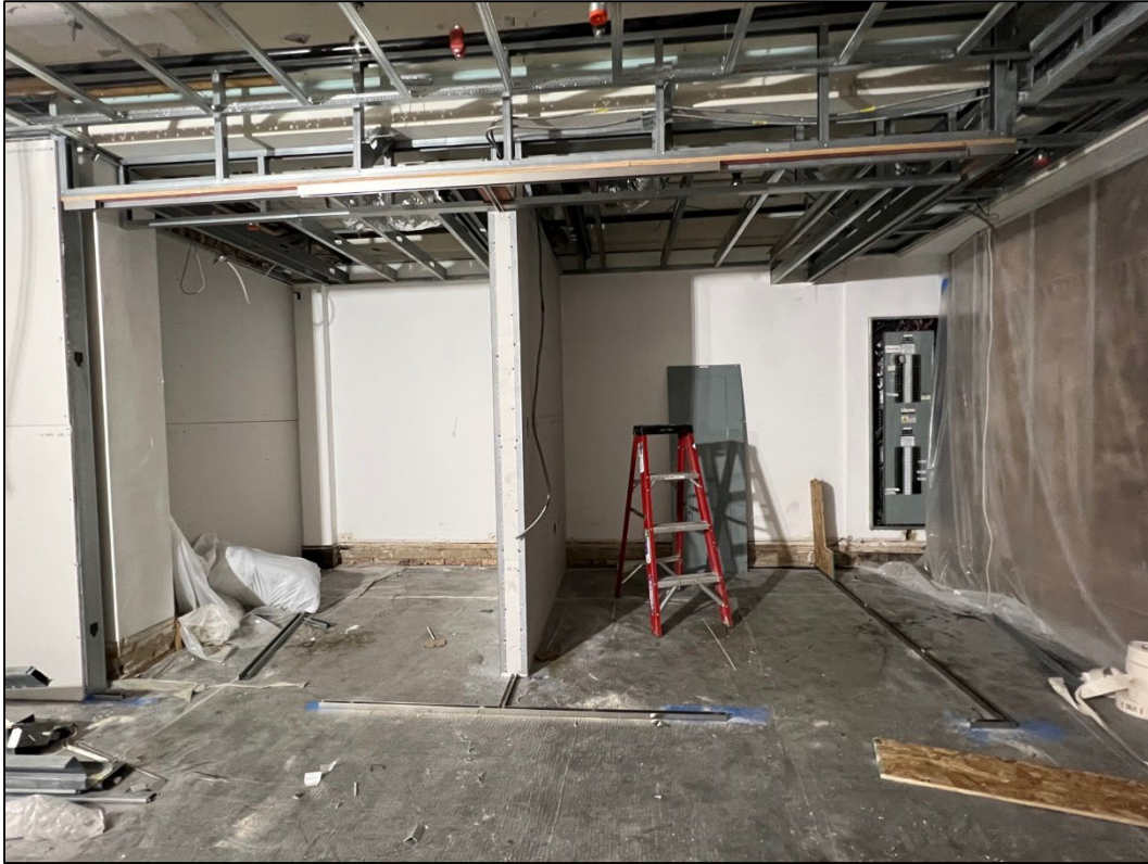
View of two new study rooms on west side (above) and east side (below) of the center gallery.