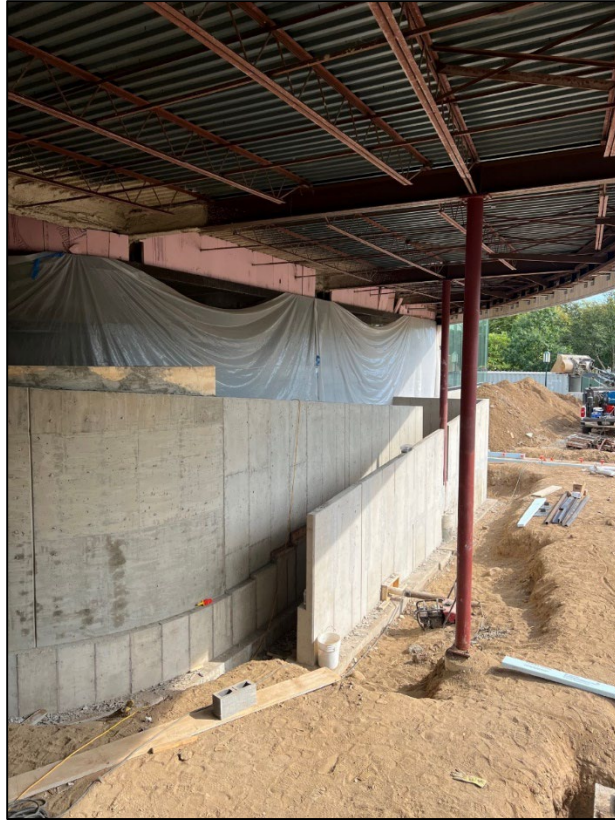
View of new ramp walls in progress.