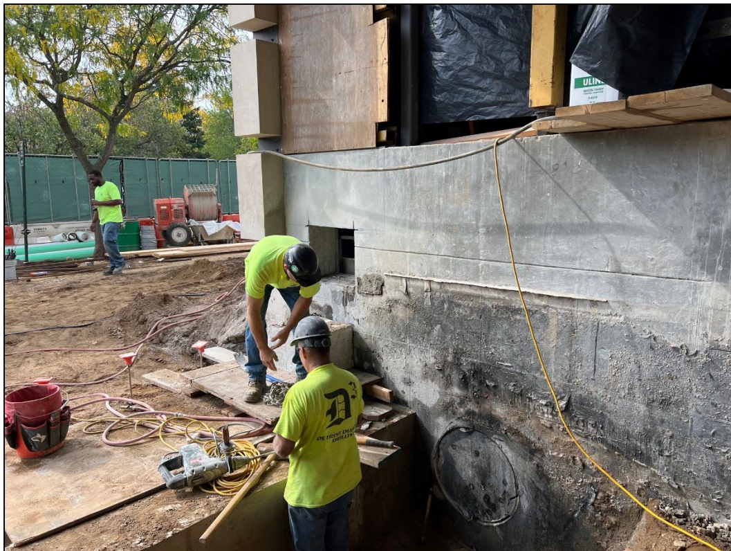
View of hole for new exterior book return slot.