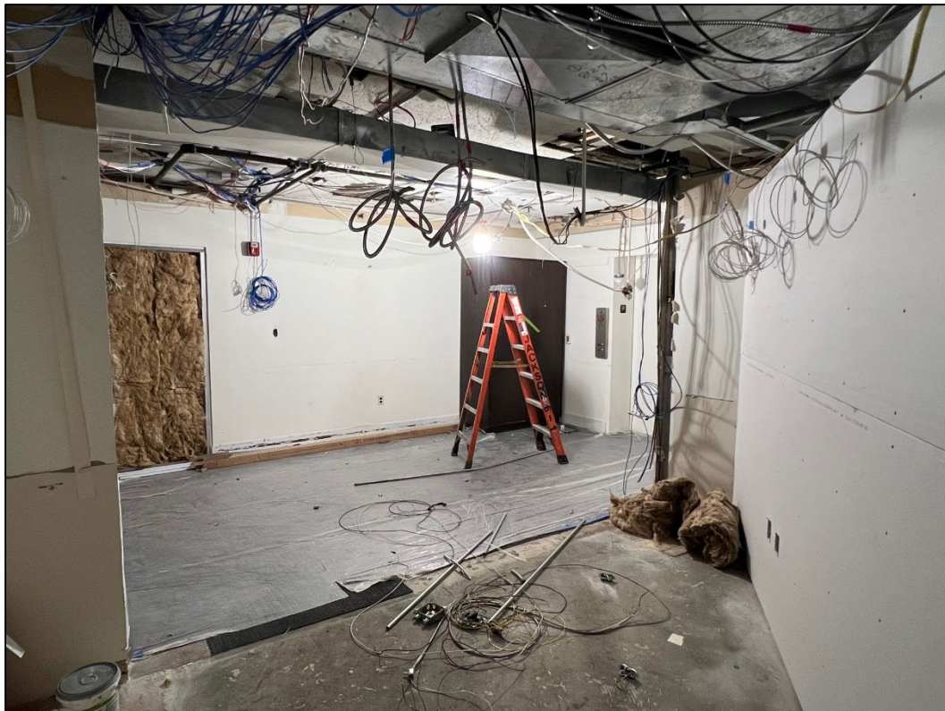
View of expanded Access Services staff office space