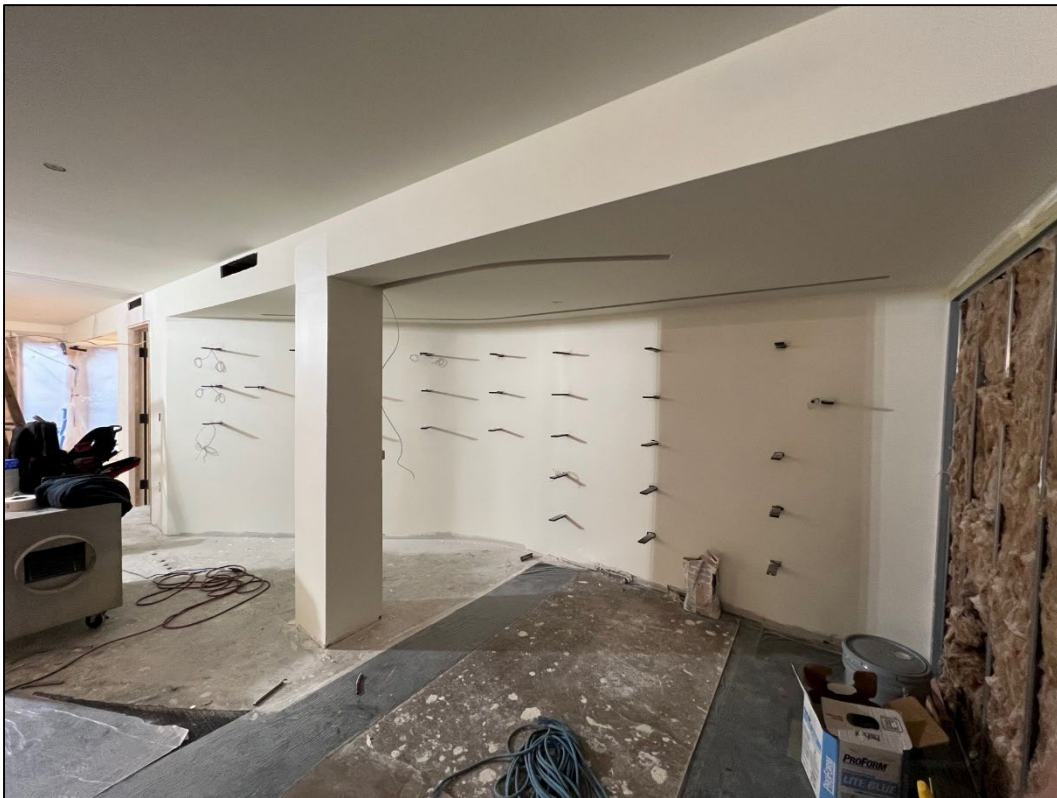
Friends' Bookshop in progress.