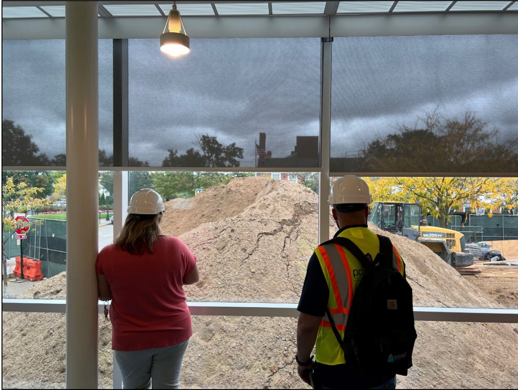
View of pile of excavated dirt as seen from inside Grams Discovery Room.