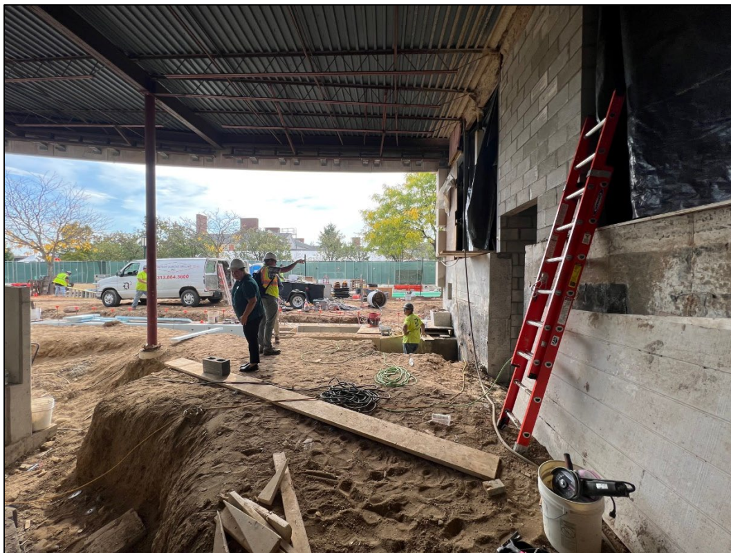
View of future front entrance from base of future stairway.