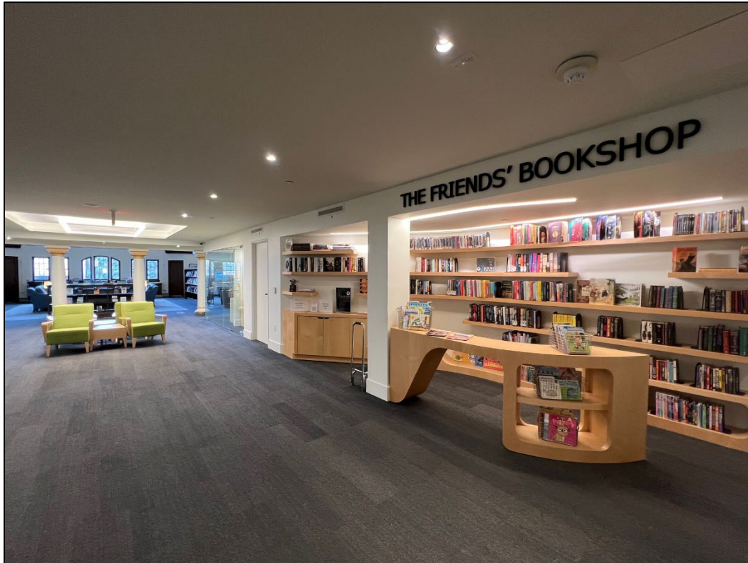
November 1: New gallery featuring The Friends' Bookshop