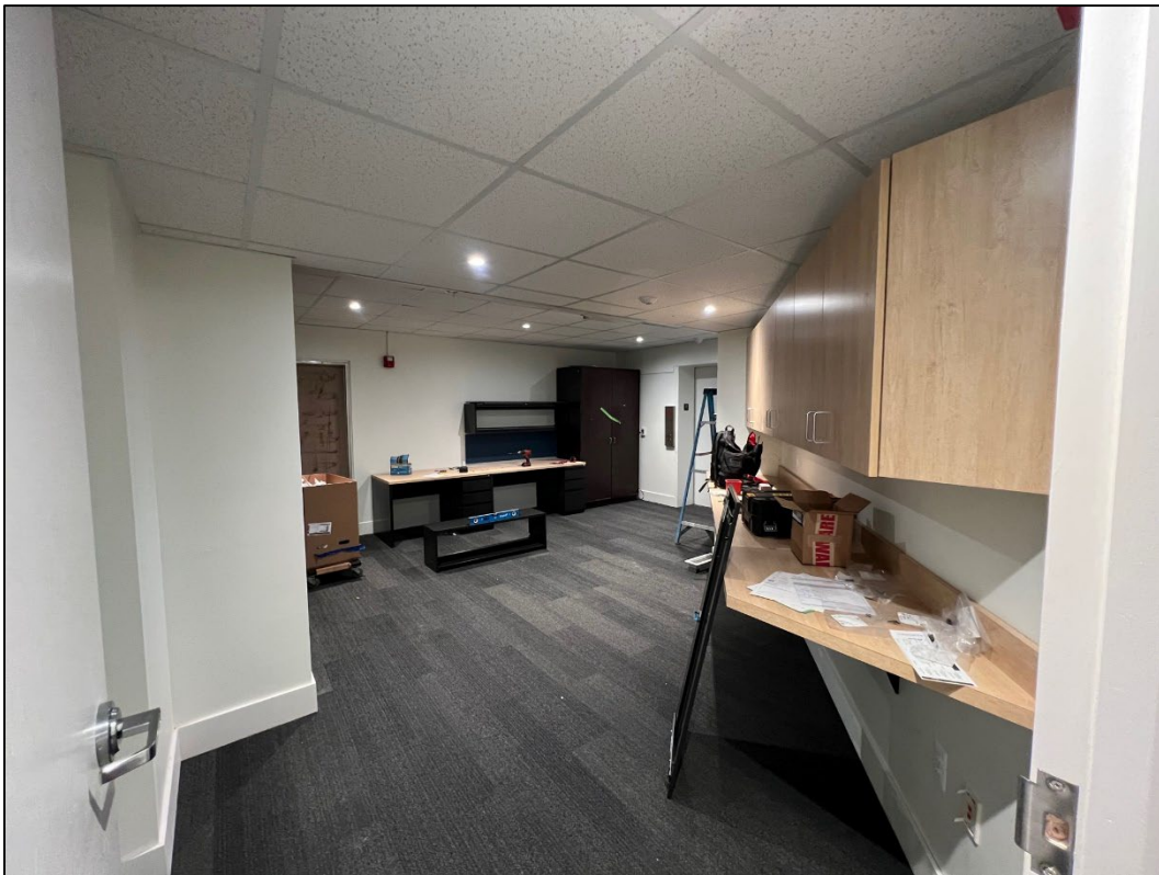
Staff workroom in progress