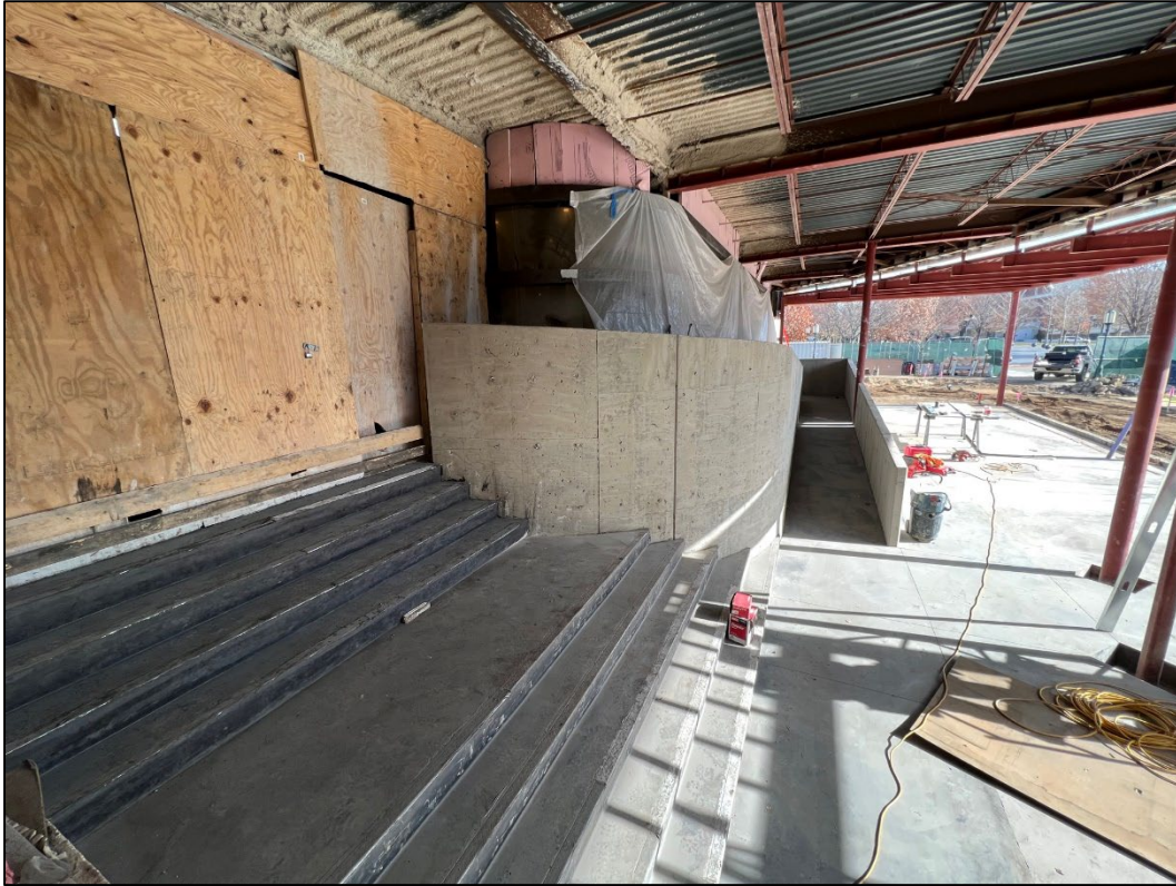
Poured entry stairs, top curve of new ramp, and future main floor landing.