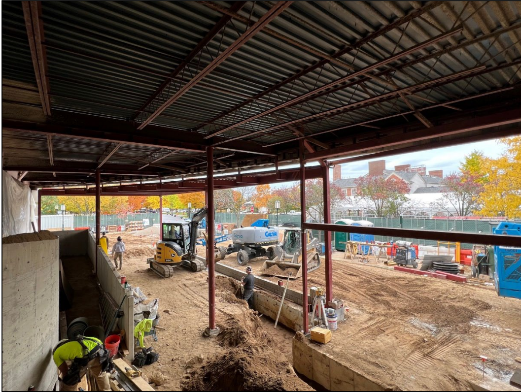
Structural steel installation in progress