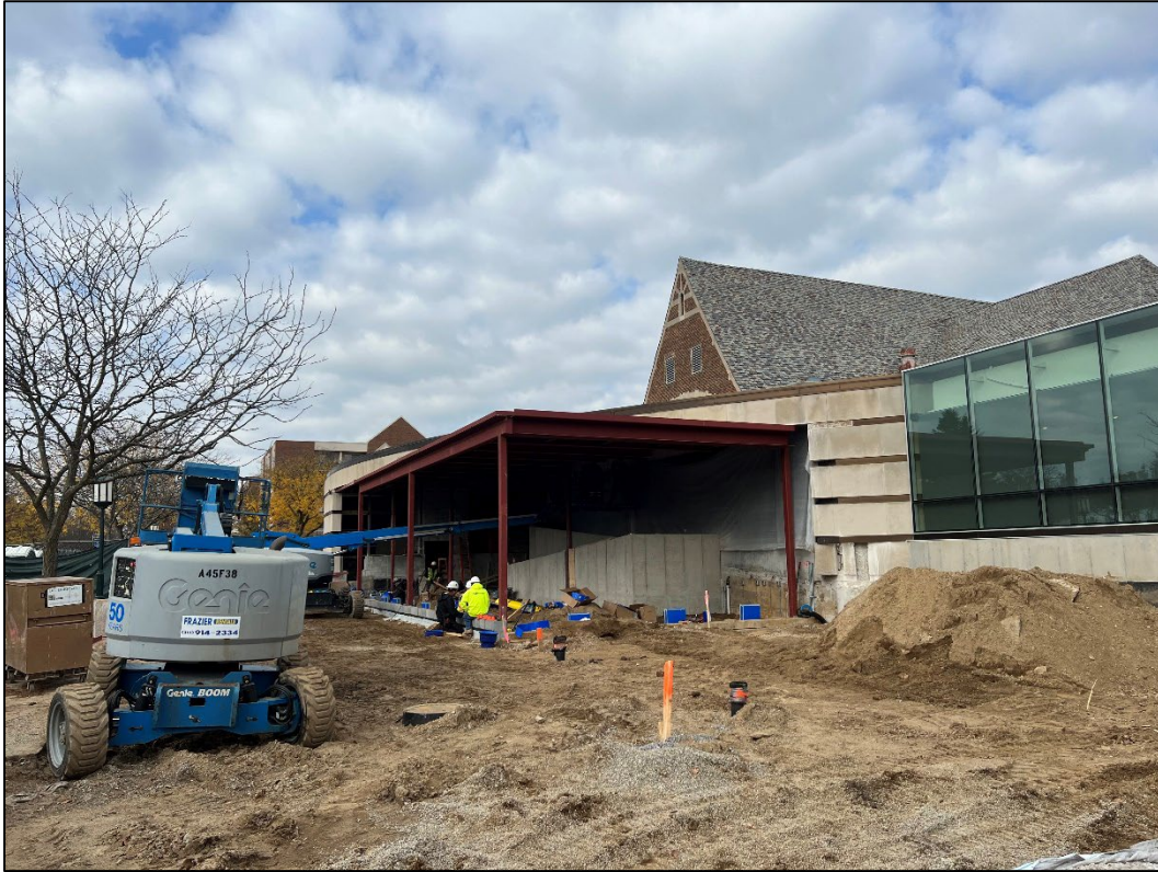
October 31: Exterior progress