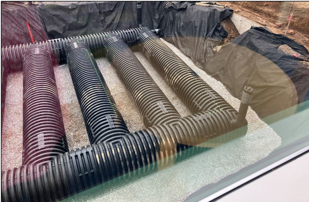
October 18: Water detention system underground installation