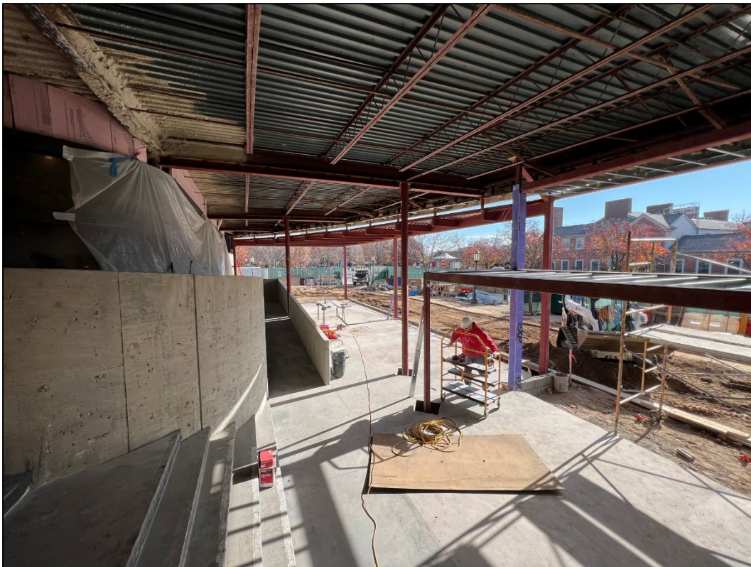
November 15: Poured addition floor, ramp, and stairs