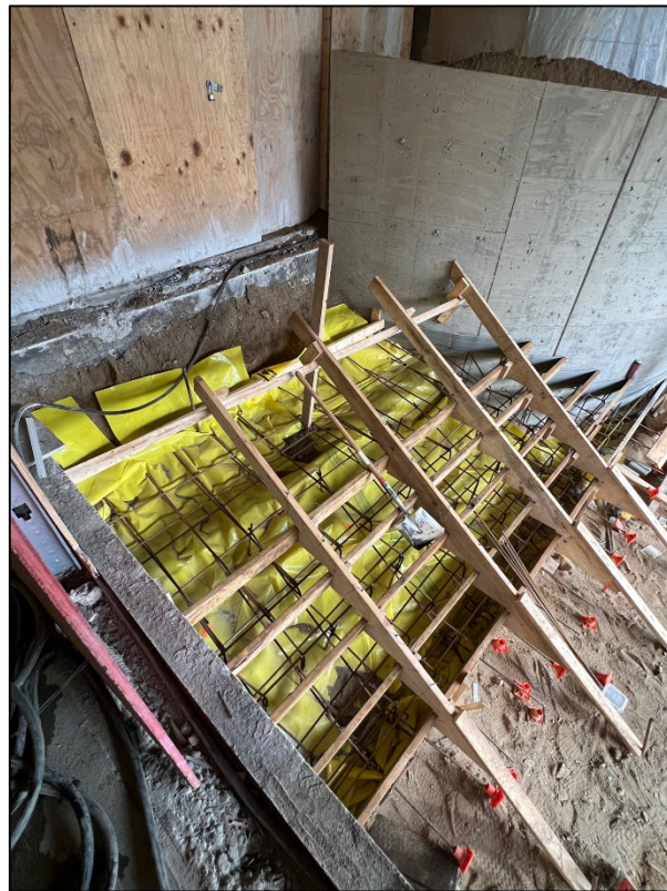
Staircase framing in progress