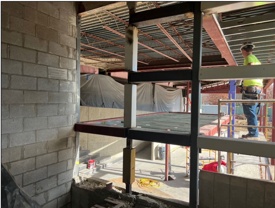
Progress on vestibule canopy as seen from future book sorter room.