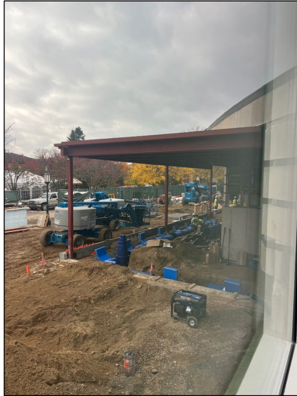
New underground HVAC piping in progress.