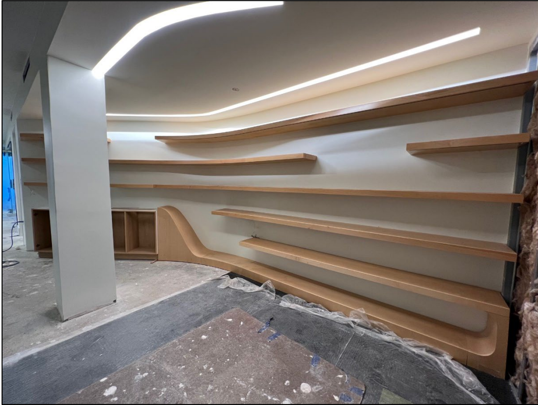
October 25: Friends's Bookshop shelving in progress.