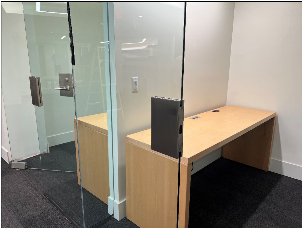
New study rooms