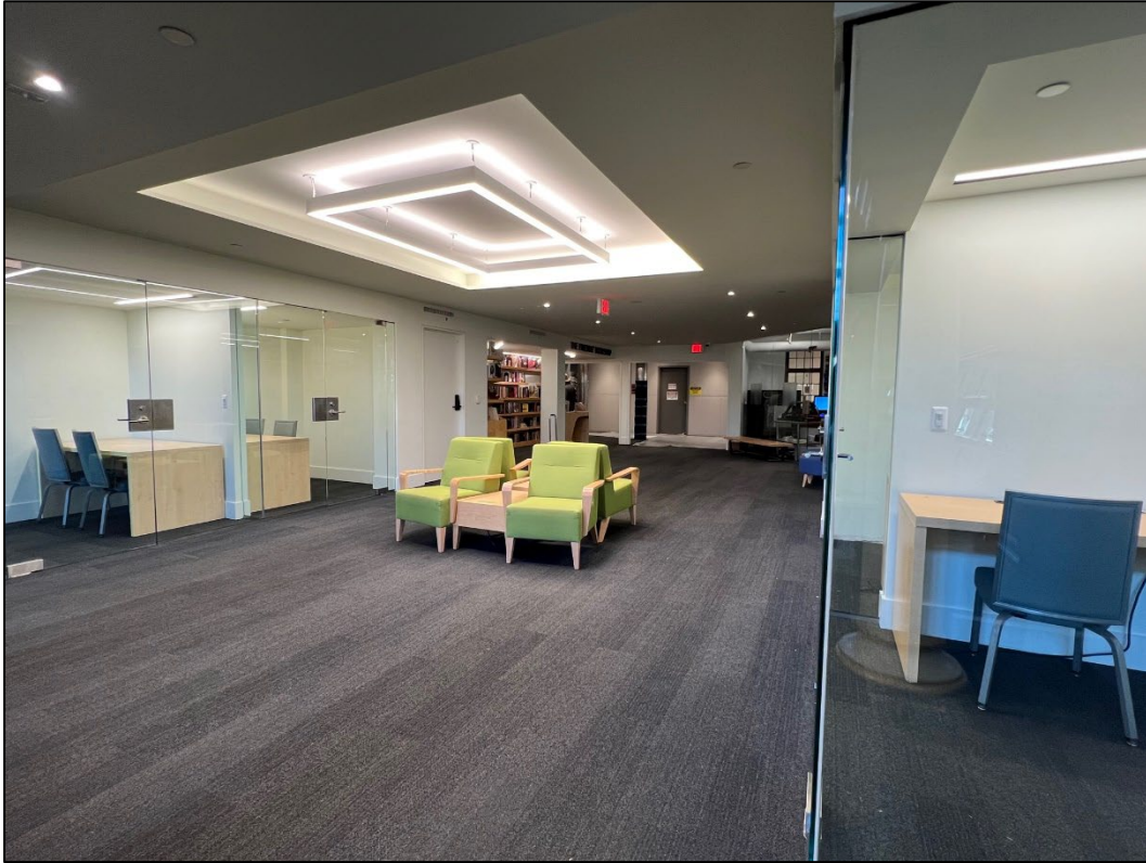
Gallery looking south to study rooms