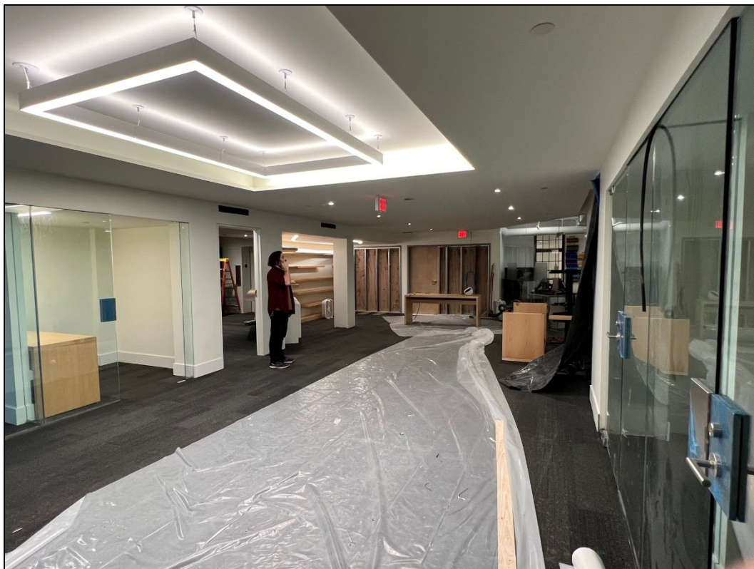
Gallery in progress – looking south