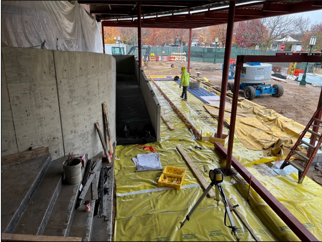
November 8: Flooring preparation work