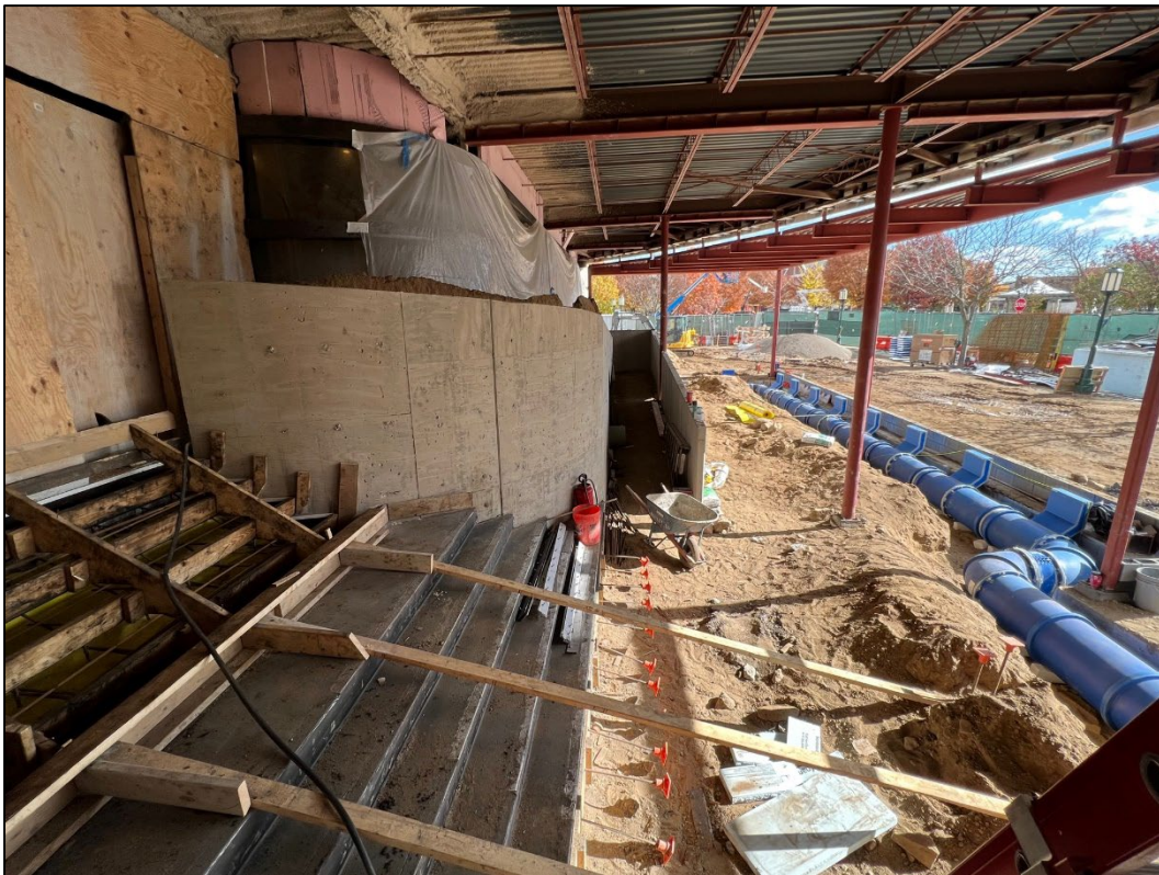
Front steps in progress