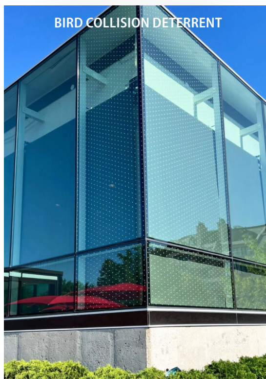
BIRD COLLISION DETERRENT